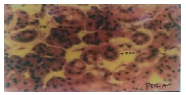
Figure 1: Microphotograph of T.S. of Thyroid Gland of Control Albino Rat Stained With Haematoxylin& Eosin (X 6000)